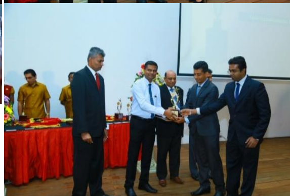
Appraisers with their achievements

We are the member of and Sri Lankan Representative for World Association of Public Employment Services. (WAPES)