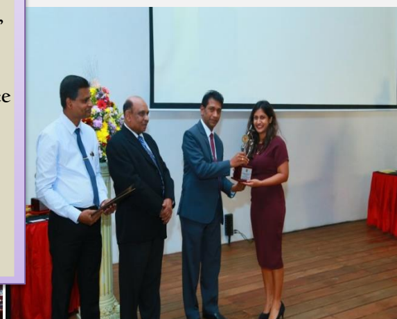
Opening Ceremony-Lak Rekiya Harasara 2018

From this program basically the employers are evaluated on the creation of new employments, practicing fair recruitment Process, ensuring occupational safety & health, compliance with labour laws contribution for uplifting the employee living standards.